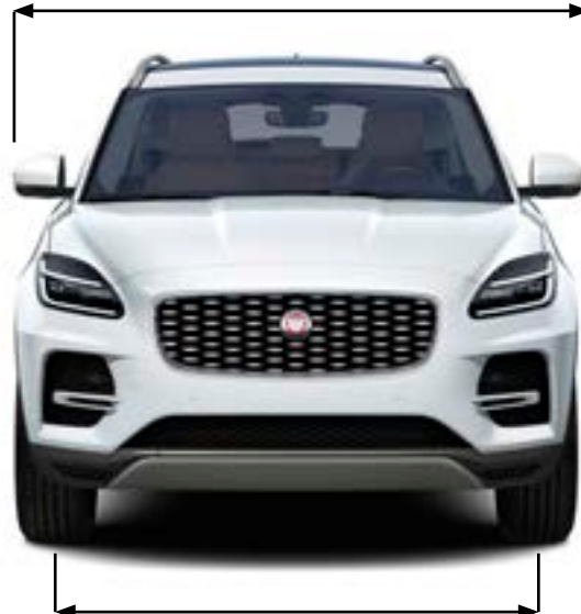
17" - 18" wheels - 1625mm 19" - 21" wheels - 1635mm

Overall Width (inc. mirrors) 2.088m (mirrors folded) 1.984mm