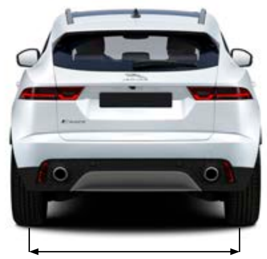
17" - 18" wheels - 1624mm 19" - 21" wheels - 1634mm